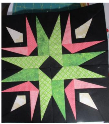
Border Lessons Show-n-Tell